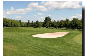
Chippanee Golf Club Marsh Road Bristol, Connecticut